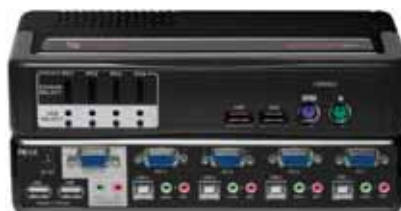
SwitchView Multimedia switch